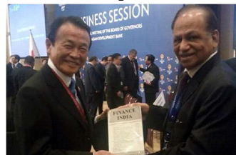
Our Chairman with Mr. Taro Aso, Deputy Prime Minister & Finance Minister of Japan (May 2017)

Faculty travelled widely to lecture or address conferences in 50+ countries from North to South, East to West including USA, UK, almost whole of Western & Eastern Europe, Russia, Uzbekistan, Japan, China, Australia, East Asia, Fiji, Brazil, Chile and Africa. Provided academic assistance to 100+ Universities/Institutions.