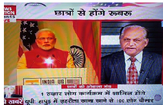
Our Chairman on NewsNation TV